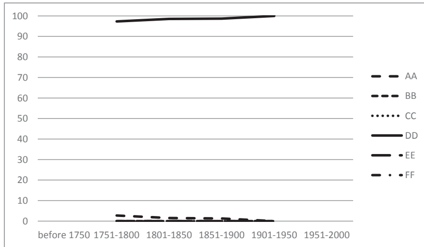
Figure 2 Figuration of Table 14